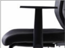
T1 - PP injection fixed armrest (For cantilever base only)