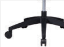
N1 - 5-star nylon base with castors