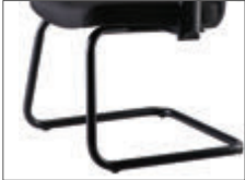
C1 - Cantilever base with studs