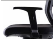
H1 - Height adjustable armrest with PU padding on top